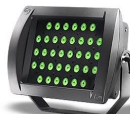
DELTA 8 B HEAD FC