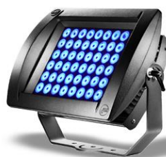
DELTA 12 HEAD FC