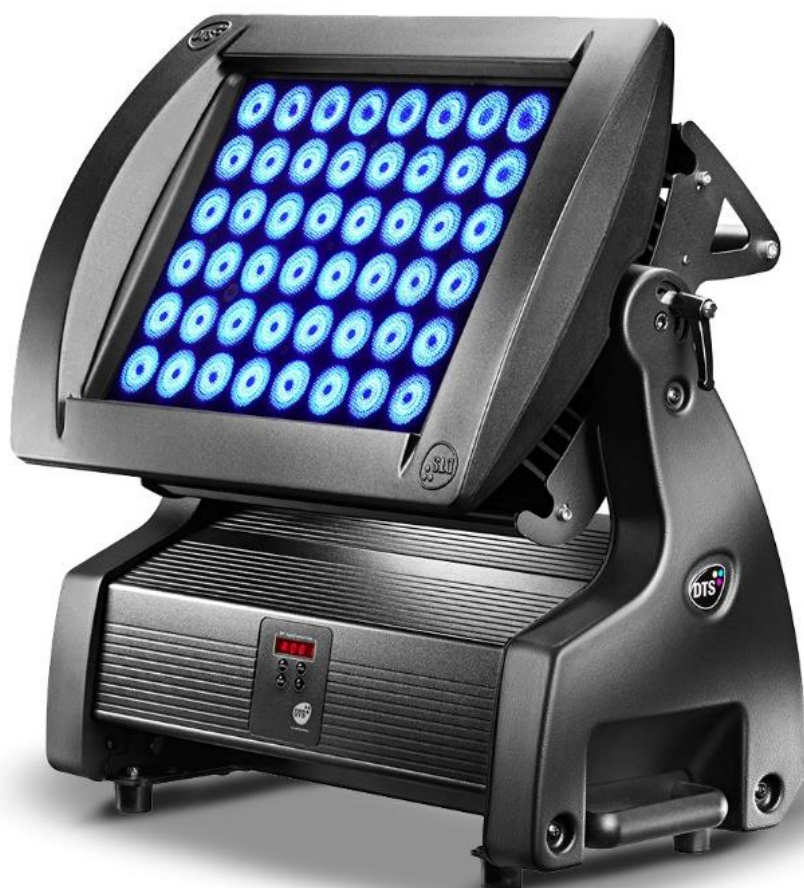
DELTA 12 FC

48 OR 36 x OSTAR RGBW LEDs HIGH QUALITY COLOR MIXING IP65 WATERPROOF WASH LIGHT VERSATILE AND COMPACT ETL CERTIFIED (DELTA 12) CUSTOMIZABLE FOR DIFFERENT APPLICATIONS DMX-CONTROLLED